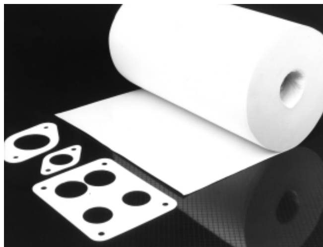
ZRCI papers are ideal as high temperature gasketing.

Type ASPA-970 is available in a variety of thickness.