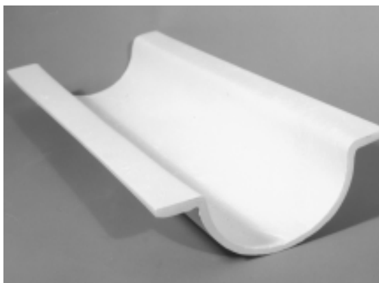
RSLE-56 Moldable makes relining troughs and casting tables easy. It can be backed up with low mass blanket, fiber board or calcium silicate to reduce the overall thickness and increase insulation value

Type RSLE-56 and RSLE-501 are 100% organic free and contain no refractory ceramic fiber. It is readily machined to precision tolerances with conventional tooling.