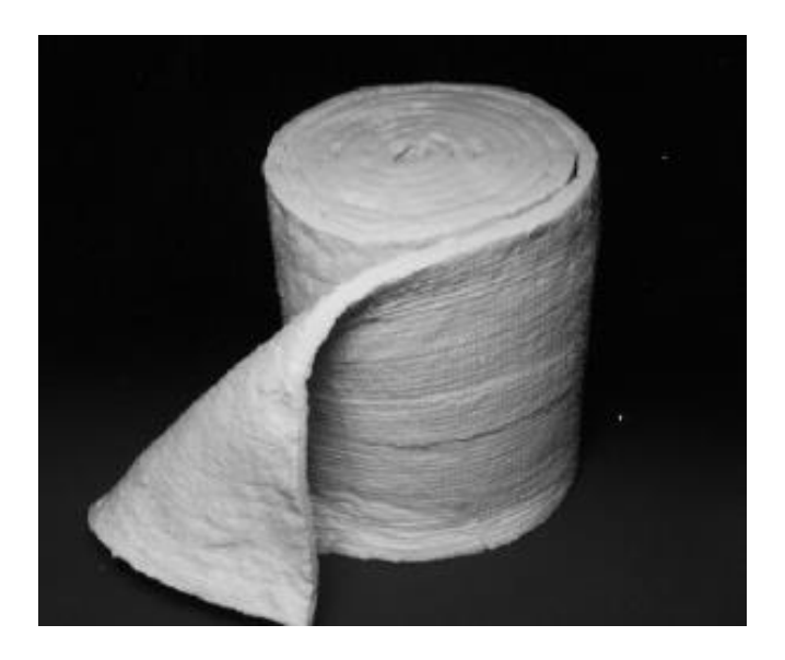
ZRCI Type RSBL-SOL Blanket are available in various densities and thicknesses.

Type RSBL-SOL Blankets provide solutions to a variety of heat processing problems. They are available in a variety of thicknesses and densities. They are ideal for use as furnace insulation in sintering, heat treating and chemical thermal process systems. They can be layered between rigid insulation, wrapped around process piping or fabricated into folded modules. They are also useful as insulation packing in furnace spaces, around furnace sight tubes & ports and fill in expansion joints and masonry cracks.