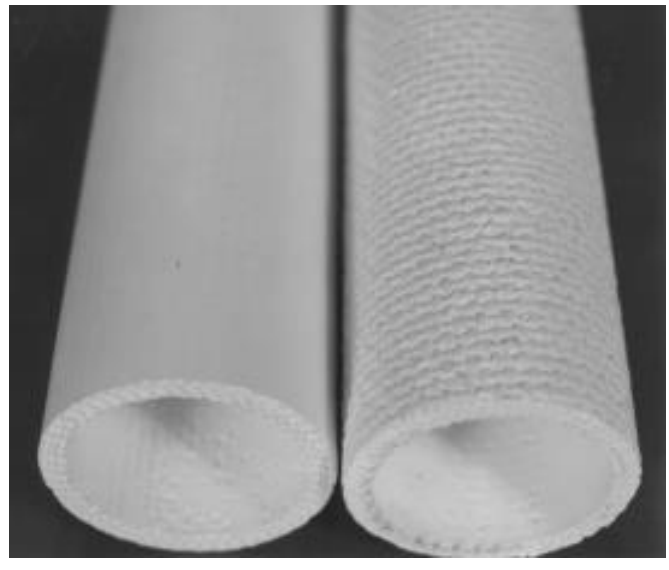
Type RS-201 (left) has a smooth burnished outside surface, Type RS-202's exterior texture reflects the weave of its reinforcing material.