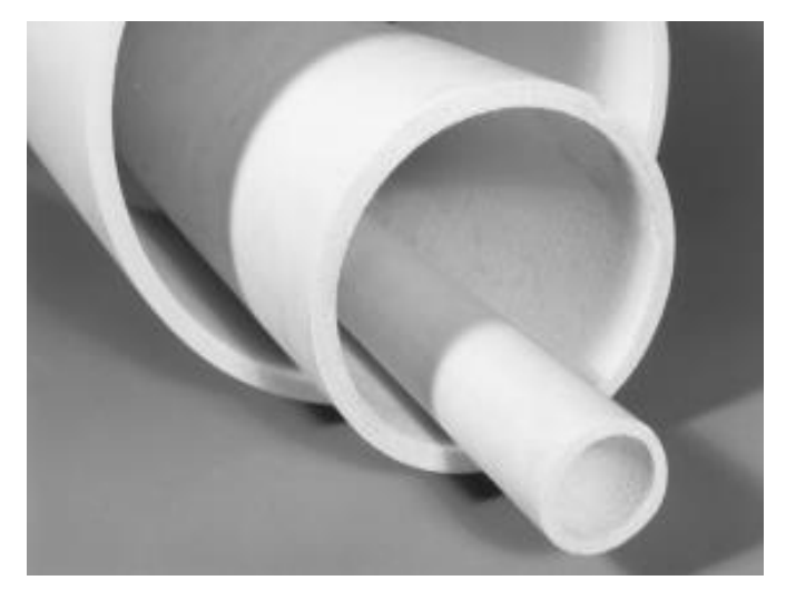
Type RS-101 Cylinders are available in many sizes.

ZIRCAR Refractory Sheet Cylinders are ideal when used in place of mullite tubing in high thermal shock applications.