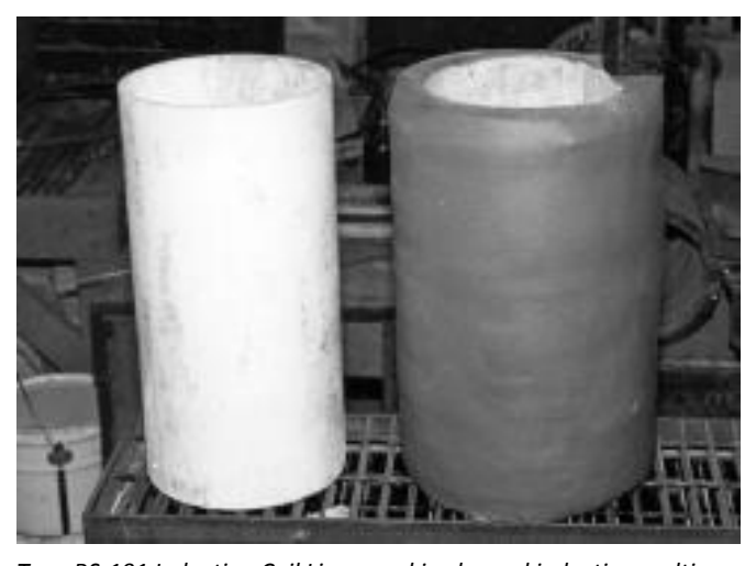
Type RS-101 Induction Coil Liner used in channel induction melting furnace