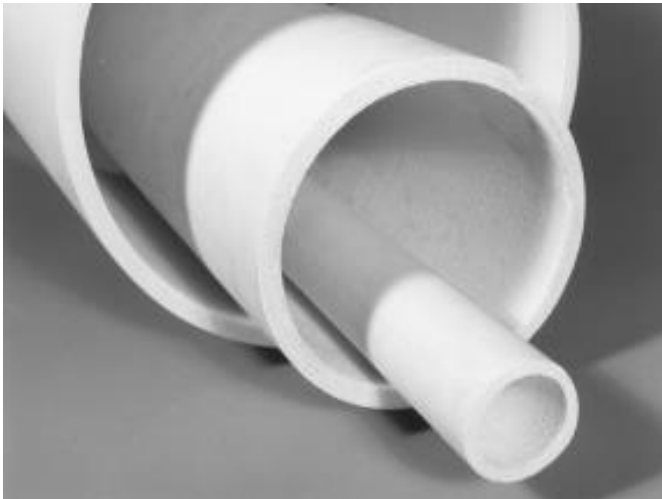
Type RS-101 Cylinders are available in many sizes.

ZIRCAR Refractory Sheet Cylinders are ideal when used in place of mullite tubing in high thermal shock applications.