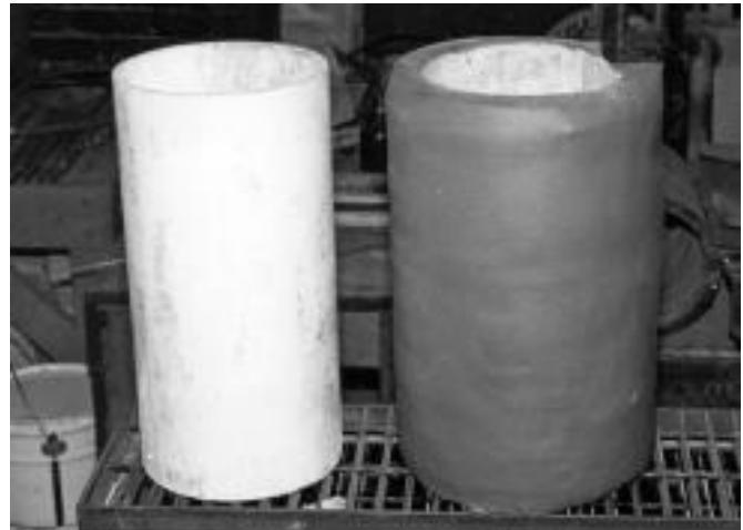
Type RS-101 Induction Coil Liner used in channel induction melting furnace