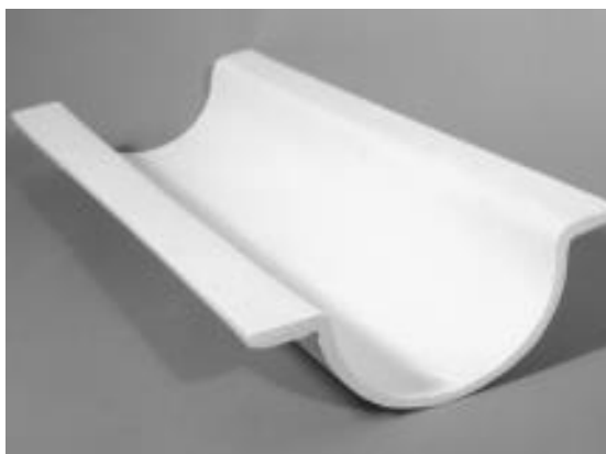
RSLE-56 Moldable makes relining troughs and casting tables easy. It can be backed up with low mass blanket, fiber board or calcium silicate to reduce the overall thickness and increase insulation value

Type RSLE-56 and RSLE-501 are 100% organic free and contain no refractory ceramic fiber. It is readily machined to precision tolerances with conventional tooling.