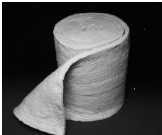
ZRCI Type RSBL-SOL Blanket are available in various densities and thicknesses.

Type RSBL-SOL is an inorganic, needled insulating blanket which is manufactured using 1400°C spun fibers. These extra-long spun fibers, cross-locked through a unique forming process, produce a blanket with good handling strength. It has excellent chemical stability and is unaffected by most chemicals except hydrofluoric and phosphoric acids and concentrated alkalis. If wet by water or steam, thermal and physical properties remain unaffected after drying. Type RSBL-SOL Blankets also provide superior resistance to attack from molten aluminum alloys at high temperatures. Type RSBL-SOL Blankets provide solutions to a variety of heat processing problems. They are available in a variety of thicknesses and densities. They are ideal for use as furnace insulation in sintering, heat treating and chemical thermal process systems. They can be layered between rigid insulation, wrapped around process piping or fabricated into folded modules. They are also useful as insulation packing in furnace spaces, around furnace sight tubes & ports and fill in expansion joints and masonry cracks.