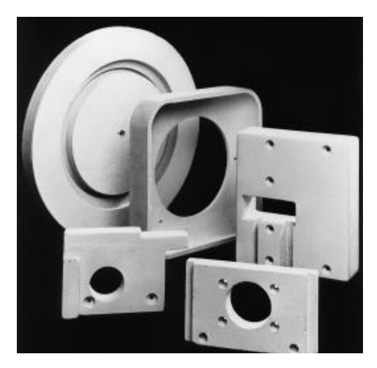
ZIRCAL-95 is ideal for machining to tight tolerances.

ZIRCAL-18, ZIRCAL-45, ZIRCAL-95, ZIRCAL-60, ZIRCAL-A