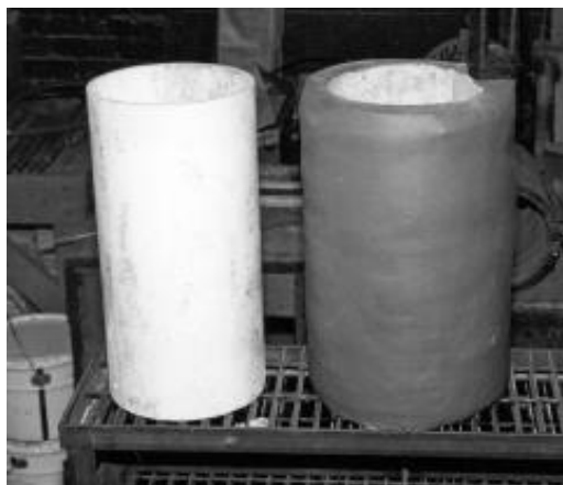
Type RS-101 Induction Coil Liner used in channel induction melting furnace