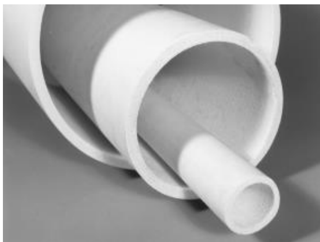
Type RS-101 Cylinders are available in many sizes.

ZIRCAR Refractory Sheet Cylinders are ideal when used in place of mullite tubing in high thermal shock applications.