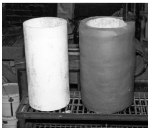
Type RS-101 Induction Coil Liner used in channel induction melting furnace