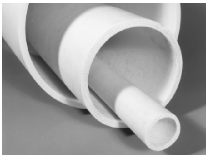
Type RS-101 Cylinders are available in many sizes.